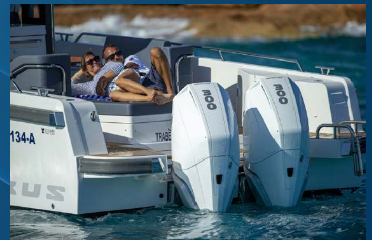
Yacht Times By Alfa Ventures IKE.