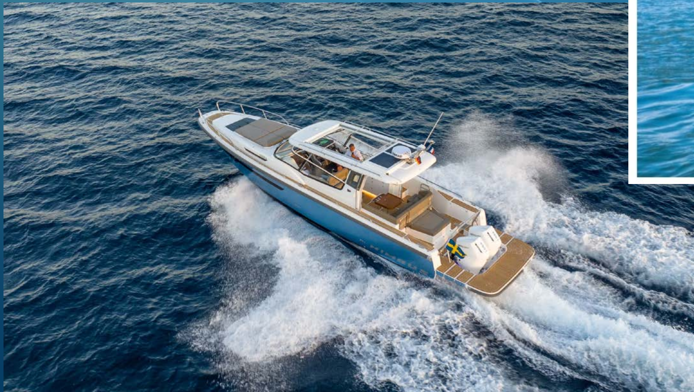
The T11 in Pictures